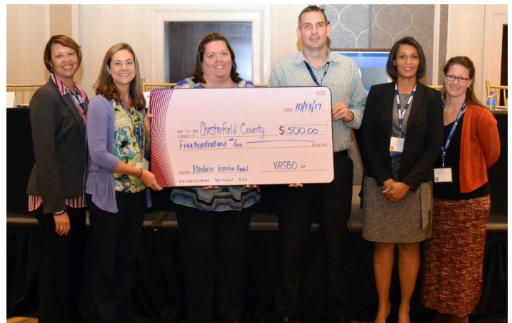
Chesterfield Team winning the $500 incentive award

The winner was Chesterfield County Public Schools!! What a great way to end the conference. Woo-hoo!