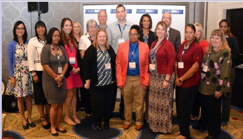
New Members Present at 2017 VASBO Conference