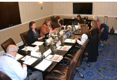
Executive Team Meeting

On Thursday, the VASBO Executive Committee and the VASBO Management Team met to affirm prioritize key initiatives for this year. Also on Thursday, Forecast5 conducted an End Users Group session, where members could ask questions and develop tools that will be of