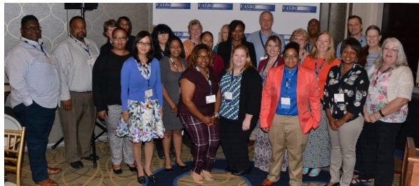
First Time Attendees