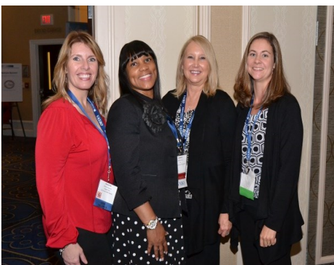
New Member Reception