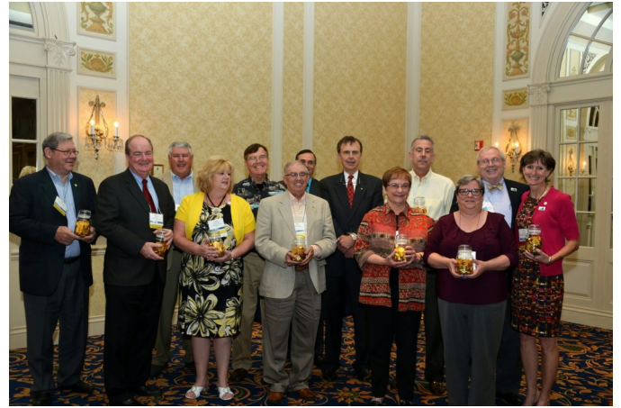
Past Presidents honored at Spring Conference in Roanoke