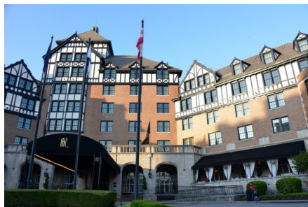
Hotel Roanoke—Site of 2016 Spring Conference