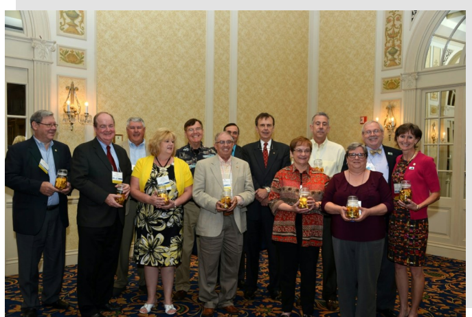
Past Presidents honored at Spring Conference in Roanoke

Past Presidents are still an integral part of the VASBO organization by being members of the Nominations Committee. Nominations for next year directors and officers are discussed and approved at the Winter Conference to be voted on at the Spring Conference. Each year at the Spring Conference VASBO honors the Past Presidents at a reception. All VASBO Past Presidents are invited to attend all conferences during 2014-15 as integral partners in all VASBO Conferences.