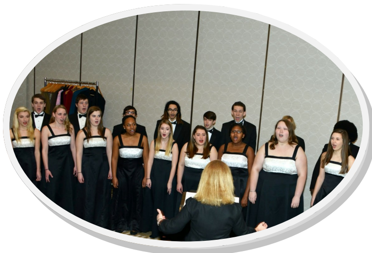
Lunch time entertainment from the Douglas S Freeman HS Festival Choir