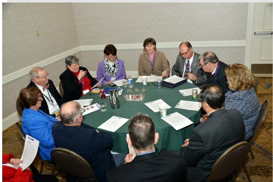
Past Presidents Conferring over the slate of Officers for VASBO in 2015-2016